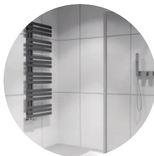
next to the shower