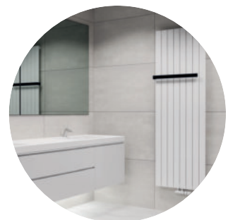
in the washroom

Leak-proof and surface finish guarantee as per applicable business and warranty conditions. For products located within reach of splashing water, the warranty is 2 years. The warranty does not apply to units installed in aggressive environments or exposed to highly corrosive substances (ammonia, chlorine, cleaning agents, soap-based substances, etc.).