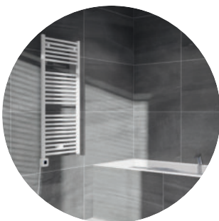
in the bathroom

color selection according to the color palette