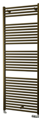
Linosa Linosa Chrom