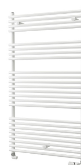
Ikaria Ikaria Double