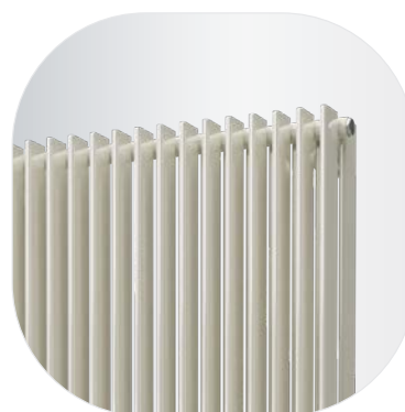
Doubled heating surface

The type of connection must be specified in the order; for more information see page 162, positions 13 and 14.