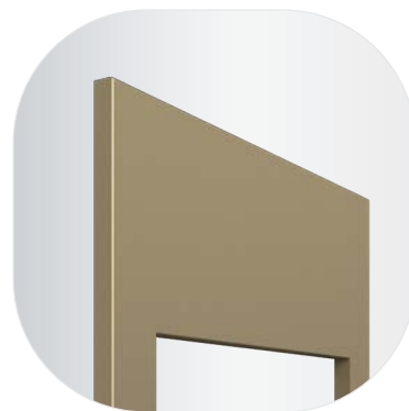
Thin square radiator cover

The thermostat and receiver are factory paired. The thermostat can control up to 5 receivers.